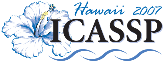
Exhibit Space Agreement

We hereby apply for exhibit space at ICASSP 2007. In making an application, we agree to exhibit under and comply with the accompanying Rules and Regulations printed under this agreement and with the Rules and Regulations in any subsequent Exhibitor Bulletin, which are hereby made a part of this contract. IMPORTANT: Closing Date for discounted Rate and Initial Space Assignment is February 9, 2007.